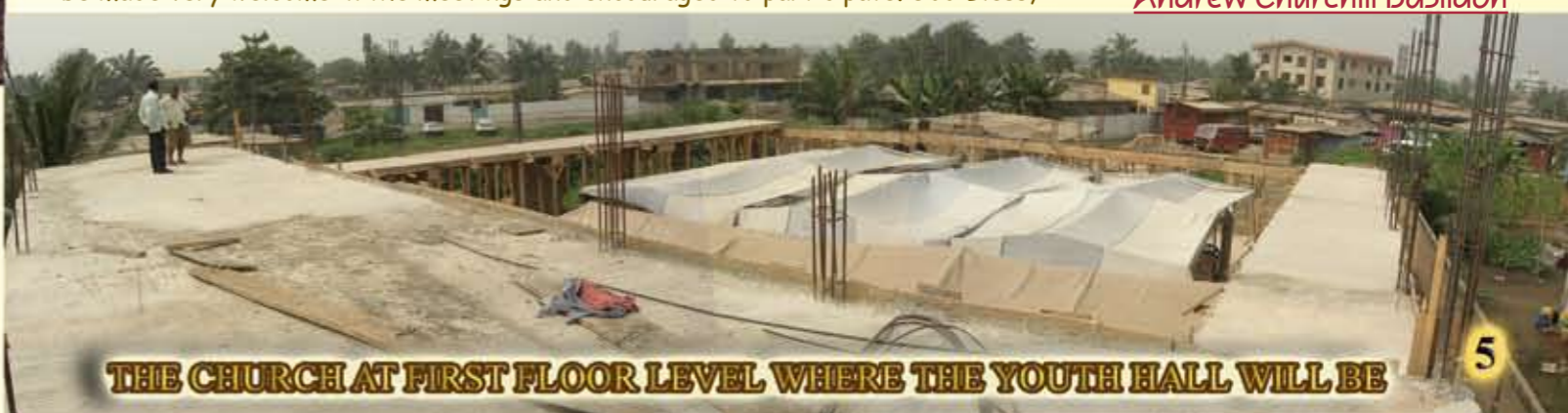
THE CHURCH AT FIRST FLOOR LEVEL WHERE THE YOUTH HALL WILL BE