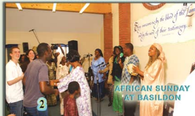
AFRICAN SUNDAY AT BASILDON

MAKE A DATE TO BE WITH US ON A SUNDAY AT 11am SOON