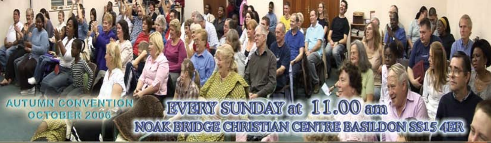
AUTUMN CONVENTION OCTOBER 2006

EVERY SUNDAY at 11.00 am NOAK BRIDGE CHRISTIAN CENTRE BASILDON SS15 4ER