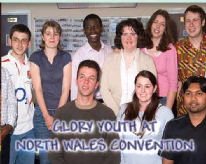
GLORY YOUTH AT NORTH WALES CONVENTION