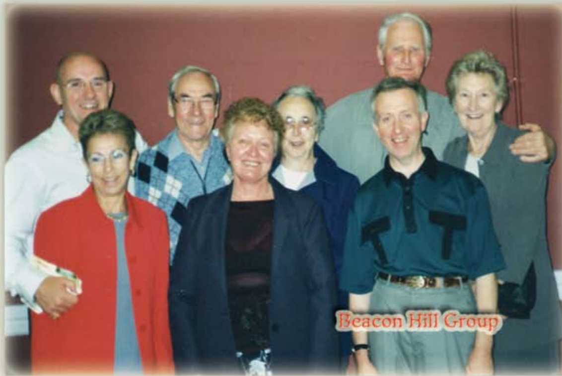
Beacon Hill Group

I am not interested in what you believe, nor am I interested