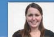
Pg 2 Basildon Youth