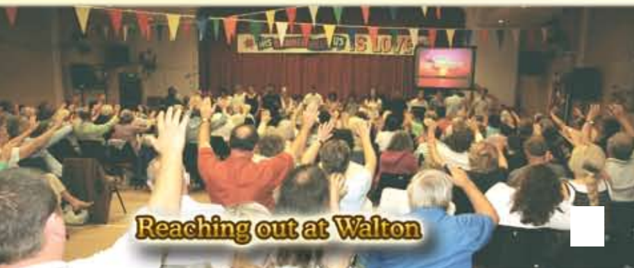
Reaching out at Walton