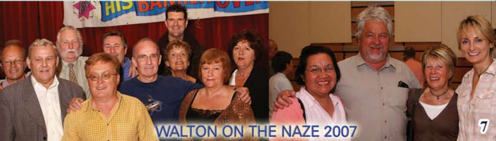
WALTON ON THE NAZE 2007