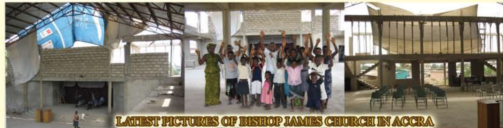
LATEST PICTURES OF BISHOP JAMES CHURCH IN ACCRA