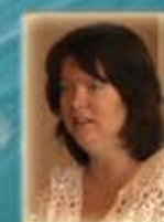
PAGE 6 ANSWERS TO PRAYER