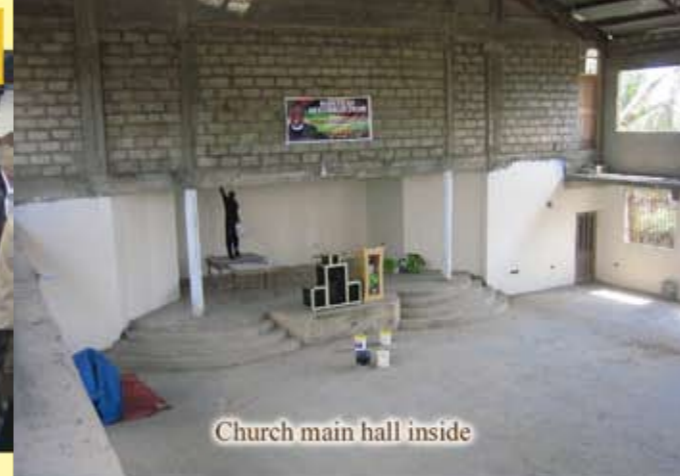
Church main hall inside