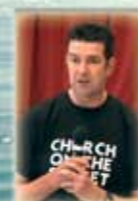
PAGE 3 CHURCH ON THE STREET