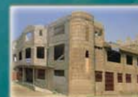
PAGE 7 ACCRA CHURCH AND ORPHANAGE