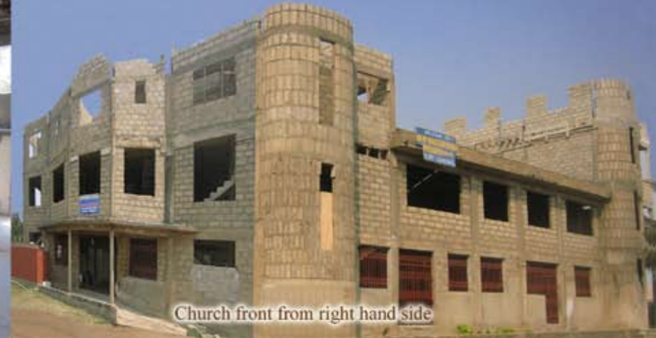
Church front from right hand side