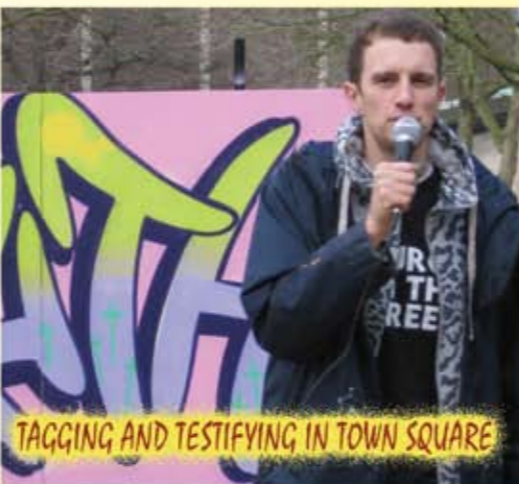
TAGGING AND TESTIFYING IN TOWN SQUARE