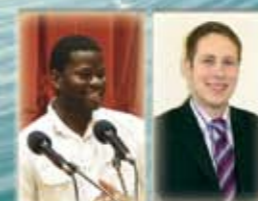
PAGE 4 and 5 TESTIMONIES FROM 2009 WALTON