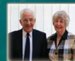
BACK PAGE ARE WE READY FOR REVIVAL