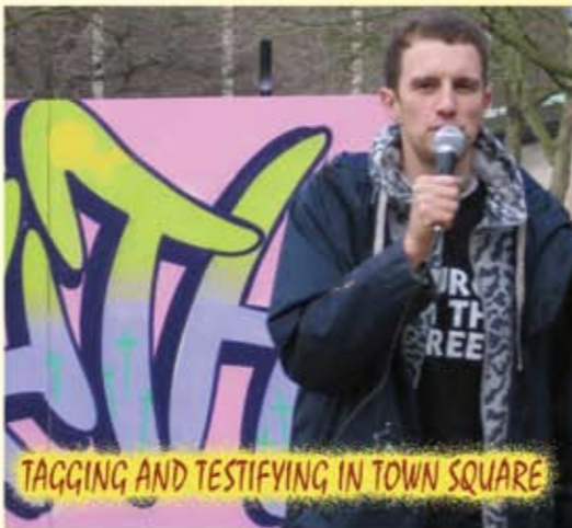
TAGGING AND TESTIFYING IN TOWN SQUARE