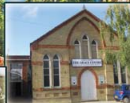
CONVENTION VENUE CHURCH ON THE ROCK GRACE CENTRE PETERBOROUGH

JOIN US AT THE THREE DAY 2015 HOLY SPIRIT LED Glory Summer Convention Weds 22 nd to Friday 24 th July 2015 @ 7.00pm