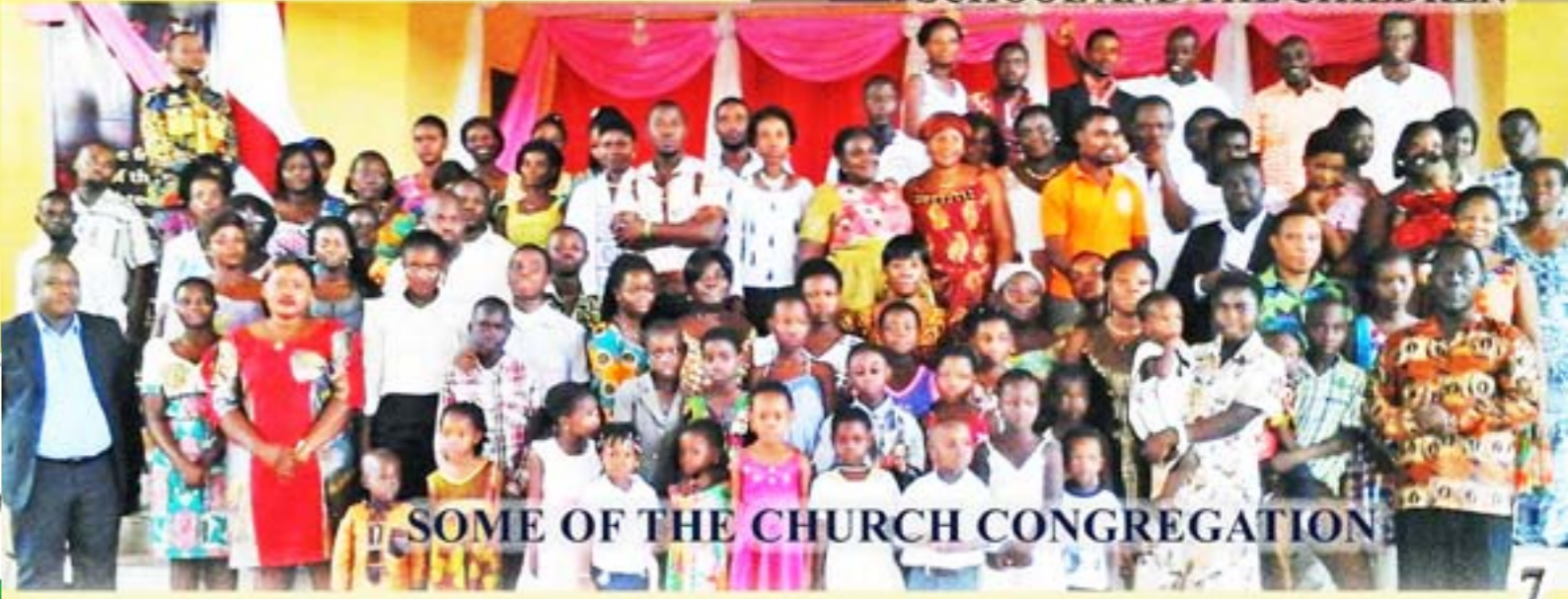
SOME OF THE CHURCH CONGREGATION

GLORYPEOPLE MEDIA SITE OPEN OUR WEBSITE @ for our new VIDEO STREAMING http://www.glorypeople.org/media-articles/videos