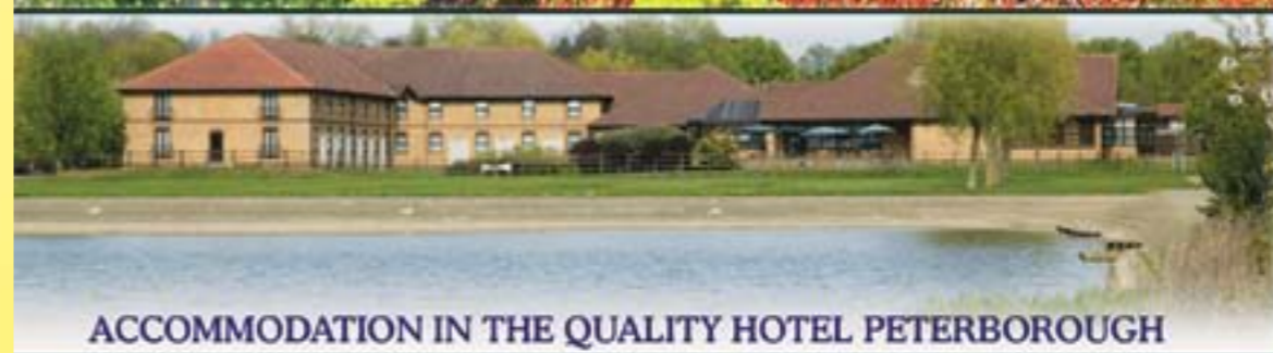
ACCOMMODATION IN THE QUALITY HOTEL PETERBOROUGH

NEWS REPORTS and TESTIMONIES From around the Glory Fellowship